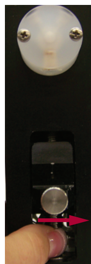
Figure 2. Twist the lead screw to the right to lower the syringe platform.