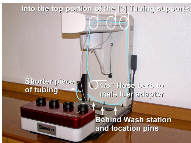
Figure 2: Longer Tygon Tubing routing diagram.